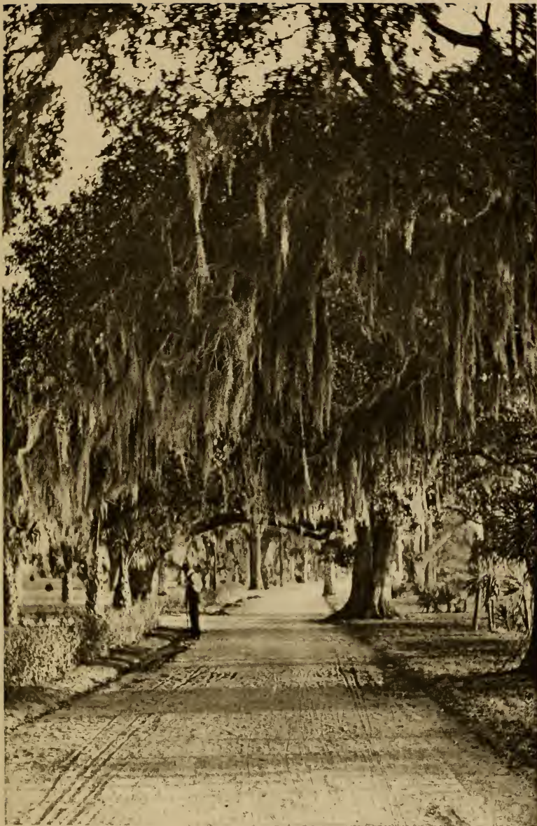
LIVE OAKS AND MOSS CLUB GROUNDS